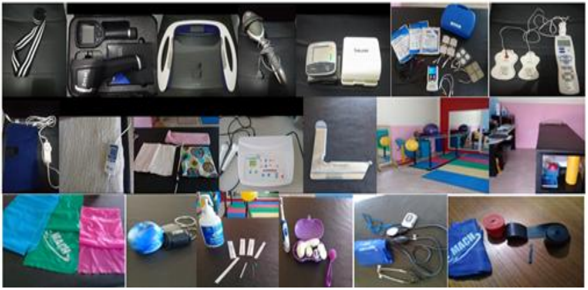
Figure 1. Materials and equipment used for therapies.