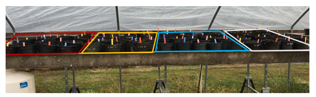
Figure 2.Experimental split plot depicted on one of three ebb and flow tables. Left to right: 2000 ppm Pb, 1000 ppm Pb, 500 ppm Pb, control plots.