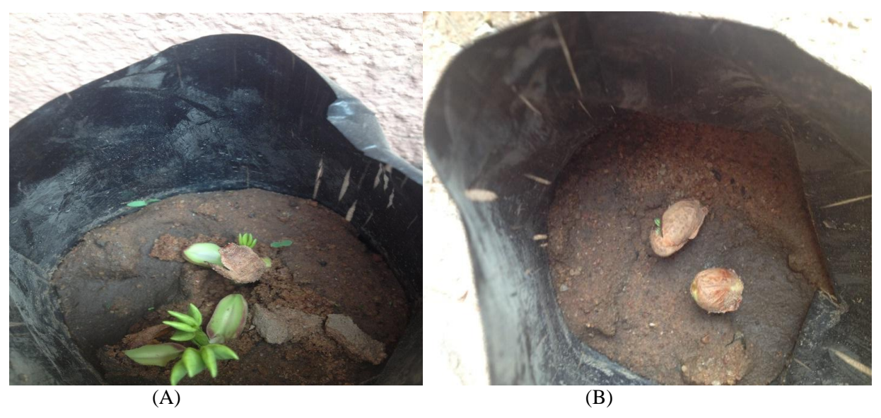
Fig 1. Germination of seed (a) after 3 days (low concentration of herbicide) and (b) after 5 days (higher concentration of herbicide).

But for pouches containing x 2.0 and x 2.5 % v/v herbicide concentrations, germination commenced only after 5 days (Fig 1b). A close examination of the plant also revealed some differences in the nature of growth of the seeds from the various concentrations with those of control, x 0.5, x 1.0 and x 1.5 % v/v showing normal growth (Fig 2a), while those in pouches containing x 2.0 and x 2.5 % v/v herbicide concentrations showing some evidence of stuntedness and discoloration of the leaves (Fig 2b).