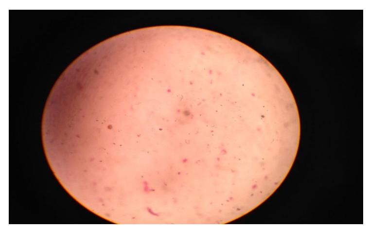
Fig 3. Gram stain reaction (pink rod-like bacilli) of Rhizobium leguminosarum